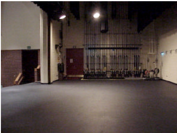
Stage Right Wing