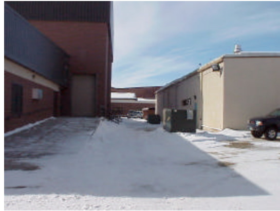
Load-in Door & Ramp area (east side of building)