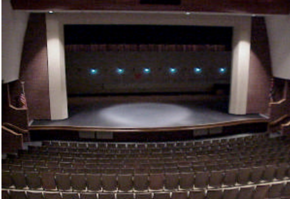
View of Stage from sound booth