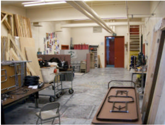
Scene shop / Green room area (located off SR)