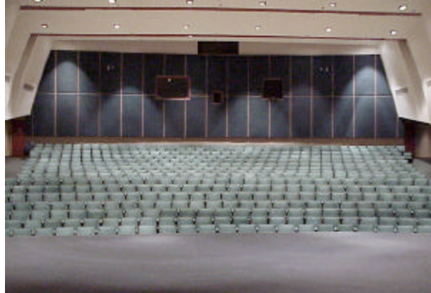
View of House from stage