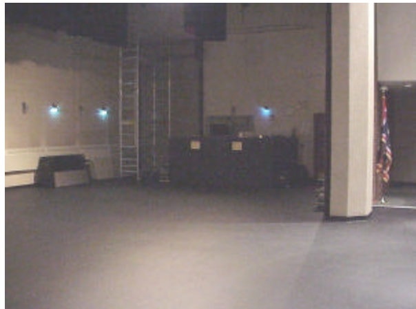
Stage Left Wing, Load-In Door