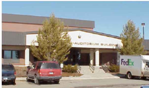
Front of Building (Hennick St.)